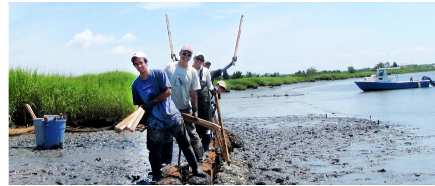
2008 - PDE and Rutgers Haskin Shellfish Research Lab staff installed a living shoreline along eroding marshes of the Maurice River in New Jersey as part of the Delaware Estuary Living Shoreline Initiative. While living shorelines are now an established restoration tactic, they were still an emerging approach at the time and one we are proud to have helped advance since 2008.