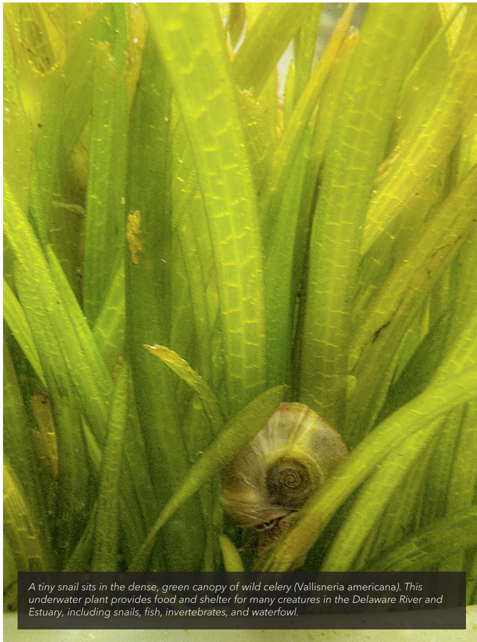
A tiny snail sits in the dense, green canopy of wild celery ( Vallisneria americana ). This underwater plant provides food and shelter for many creatures in the Delaware River and Estuary, including snails, fish, invertebrates, and waterfowl.