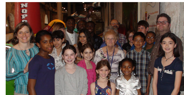
2011 - More than 800 students submitted original drawings and videos to the Protecting Philadelphia's Hidden Streams Art Contest. The drawings and videos focused on clean water and encouraging dog owners to pick up after pets. PDE continues this tradition of using art as an inspiration for environmental appreciation and stewardship through annual contests and the pilot Artist in Residence Program, which will conclude this fall.