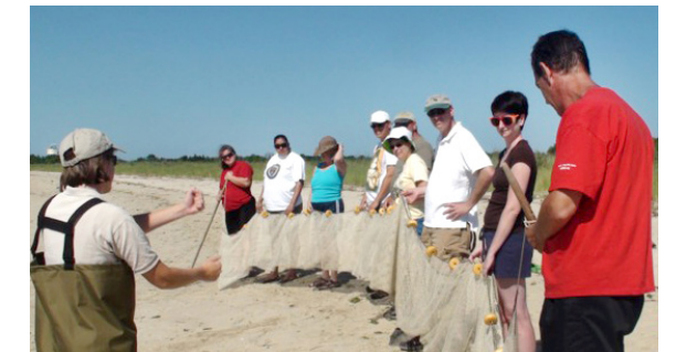
2011 - PDE hosted the 14 th annual Delaware Estuary Teachers' Watershed Workshop. For a week in July, teachers explored the Estuary and learned about the plants, animals, and waterways that make our region unique. Here, teachers participate in a seining activity at Cape Henlopen State Park in Lewes, Delaware.