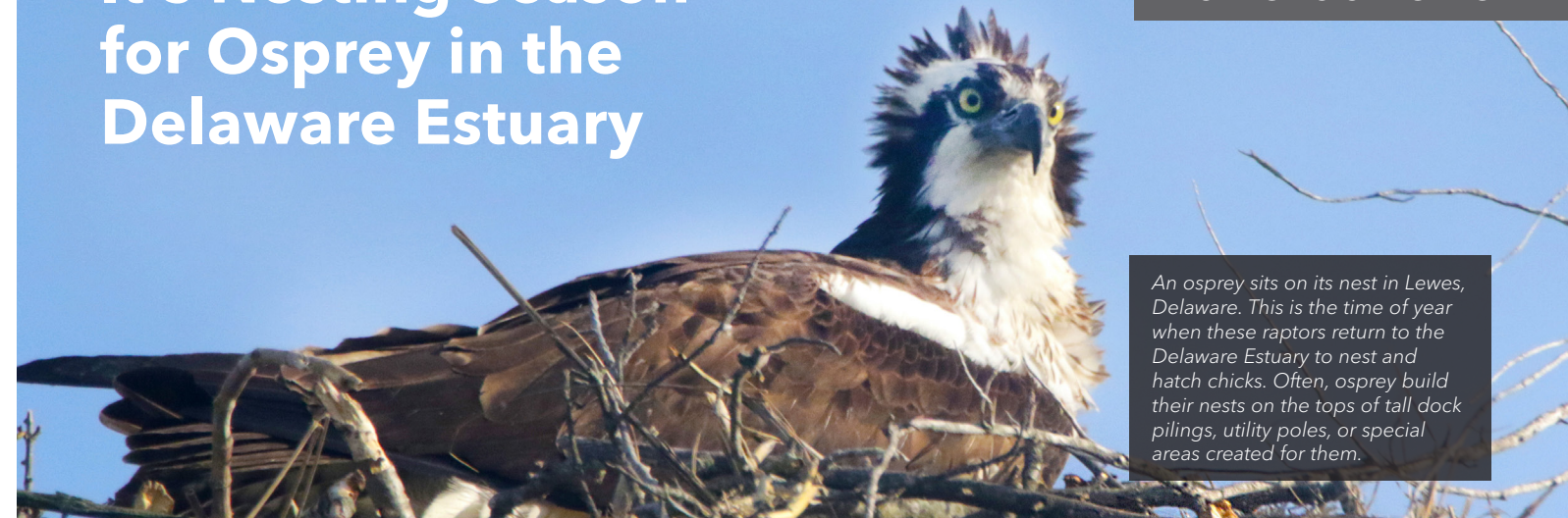
An osprey sits on its nest in Lewes, Delaware. This is the time of year when these raptors return to the Delaware Estuary to nest and hatch chicks. Often, osprey build their nests on the tops of tall dock pilings, utility poles, or special areas created for them.

Guess who’s back? Osprey have returned to the Delaware Estuary from their seasonal southward migration – and by now, they’re not just nesting. They’re hatching chicks.