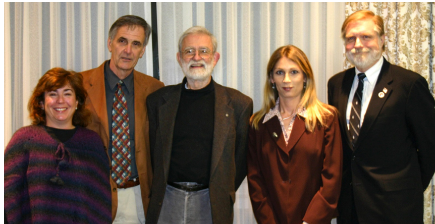
2005 - The first Delaware Estuary Science & Environmental Summit was a two-part conference hosted in Wilmington and Cape May, New Jersey. This conference has been held every-other year since then and has spearheaded many of PDE's key scientific initiatives, and helped solidify PDE's identity as a science-based organization. The next summit is taking place in February 23 and 24 at the Clayton Conference Center in Newark, Delaware, with the call for abstracts coming later this summer!