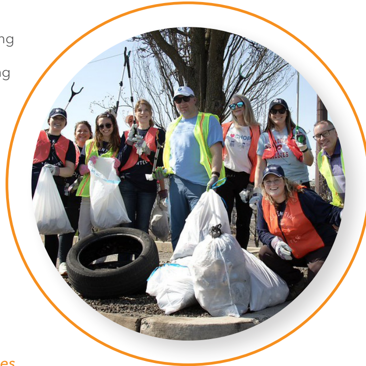
Staff from Aqua, an Essential Utilities Company, and the Children's Hospital of Philadelphia, volunteer at the annual Scrub & Pub litter cleanup in Upper Merion Township, Pennsylvania.

shared goal: keeping litter out of the waterways, including the Schuylkill River, which supplies drinking water to millions. More than 35 volunteers, including partners from Aqua, an Essential Utilities