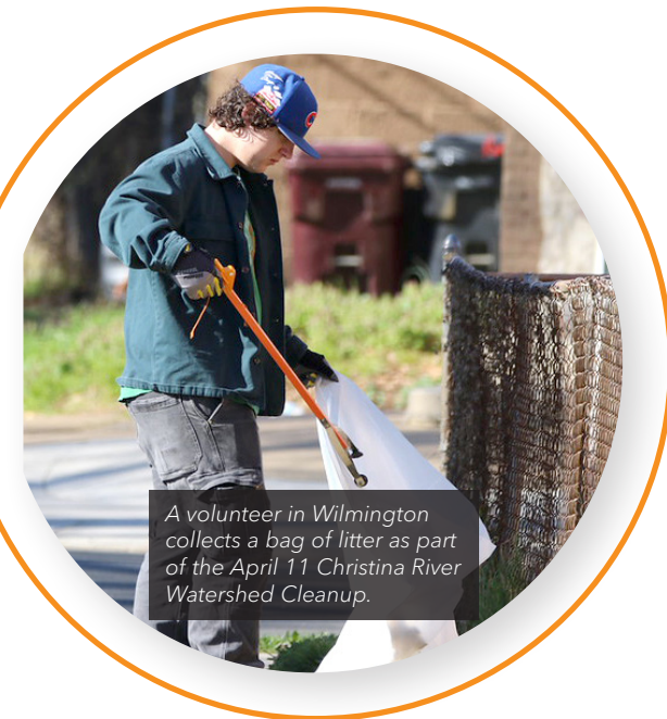
A volunteer in Wilmington collects a bag of litter as part of the April 11 Christina River Watershed Cleanup.

Christina River Watershed Cleanup – one of the region’s longest-running environmental efforts. Since 1992, the cleanup has removed more than 360 tons of tires, appliances, household items, and other debris from the Brandywine, White and Red Clay creeks, and the Christina River. This year, volunteers from all sites, stretching from Wilmington to Newark, collected roughly 8.5 tons of trash and debris, including old pipes and tires. That total included efforts from PDE’s 19 volunteers at Vandever Avenue in Wilmington who collected 640 pounds of trash. To put that in perspective: that’s about the weight of a grizzly bear.