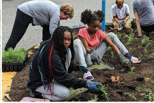
Local students help plant native plants in a new pollinator garden.

In 2022, PDE led the expansion of a native plant rain garden at a school in Salem, NJ. We also developed and installed a pollinator garden with 450 native plants at the H. Fletcher Brown Boys and Girls Club in Wilmington, DE. An educational program accompanied the project at this Boys and Girls Club, and students were involved in all stages of the process, including the weeding!