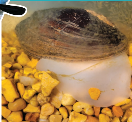
A mussel using its foot to bury itself in a streambed.

In conjunction with Bartram's Garden, PDE kicked off a capital campaign for the construction of the new Freshwater Mussel Hatchery and Ecosystems Education Center in Southwest Philadelphia. A first-of-its kind project, the hatchery could eventually produce up to 500,000 mussels each year. These animals will be used to rebuild natural mussel beds in streams, rivers, and ponds across our region and beyond.