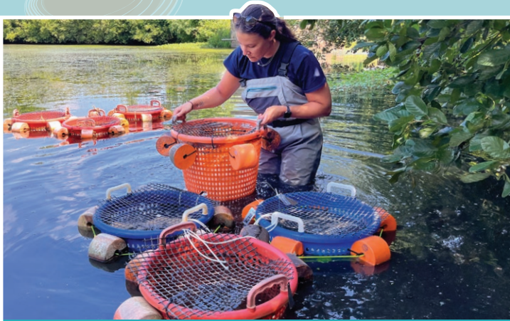
Assessing the health of mussels at Winterthur in Wilmington, DE.