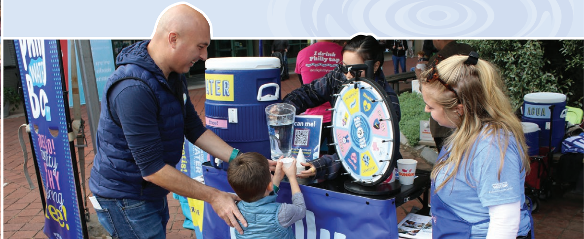
A father and son learn about their drinking water at a booth at the Delaware River Festival.