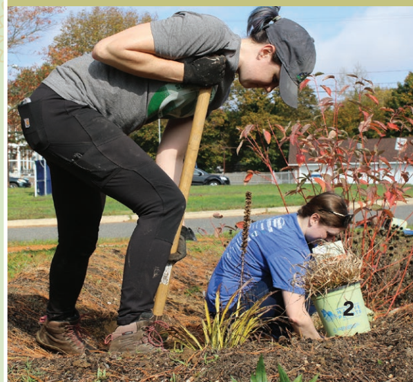
Planting a rain garden in Salem, NJ.

Green infrastructure can provide easy, low-cost solutions to manage stormwater while also improving water quality and habitats in the Delaware Estuary. PDE works with schools and communities in the region to design and install these types of projects. One of the most common issues in any habitat project is proper maintenance, such as weeding and replanting. This continued site management helps the proper long-term functioning of these projects, so our team is creating new ways to educate and engage caretakers to ensure long-term success.