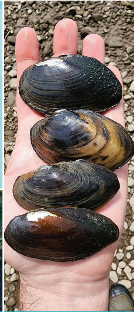
A variety of freshwater mussels.