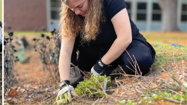
Working on a rain garden in Salem, NJ.